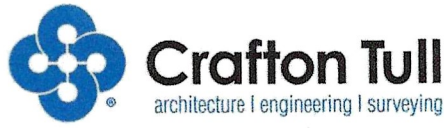
Exhibit “A” Civil Scope of Basic Services for: