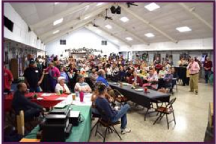
2023 Polenta Smear