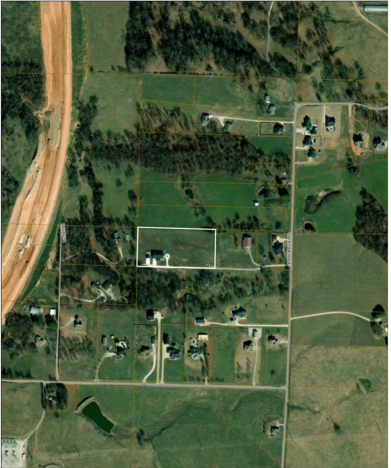
FIGURE 1: VICINITY MAP