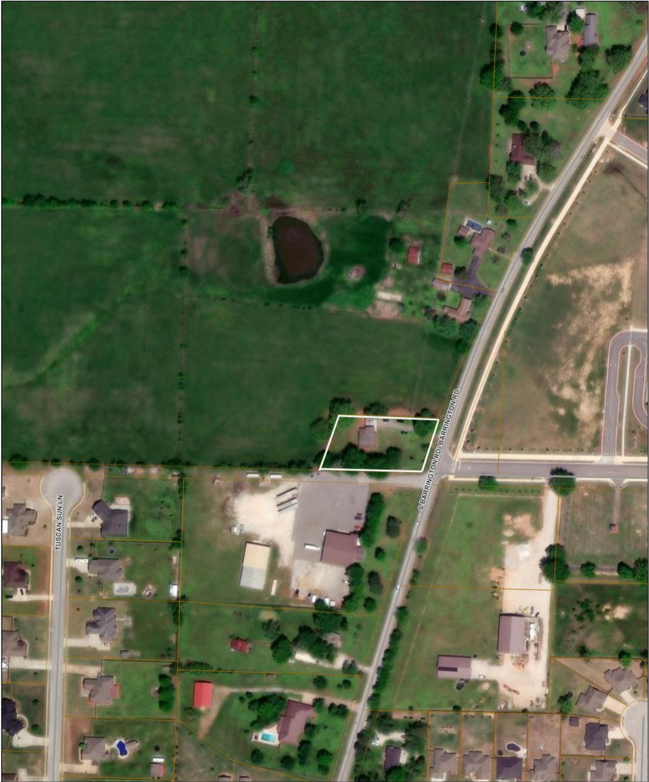
FIGURE 1: VICINITY MAP