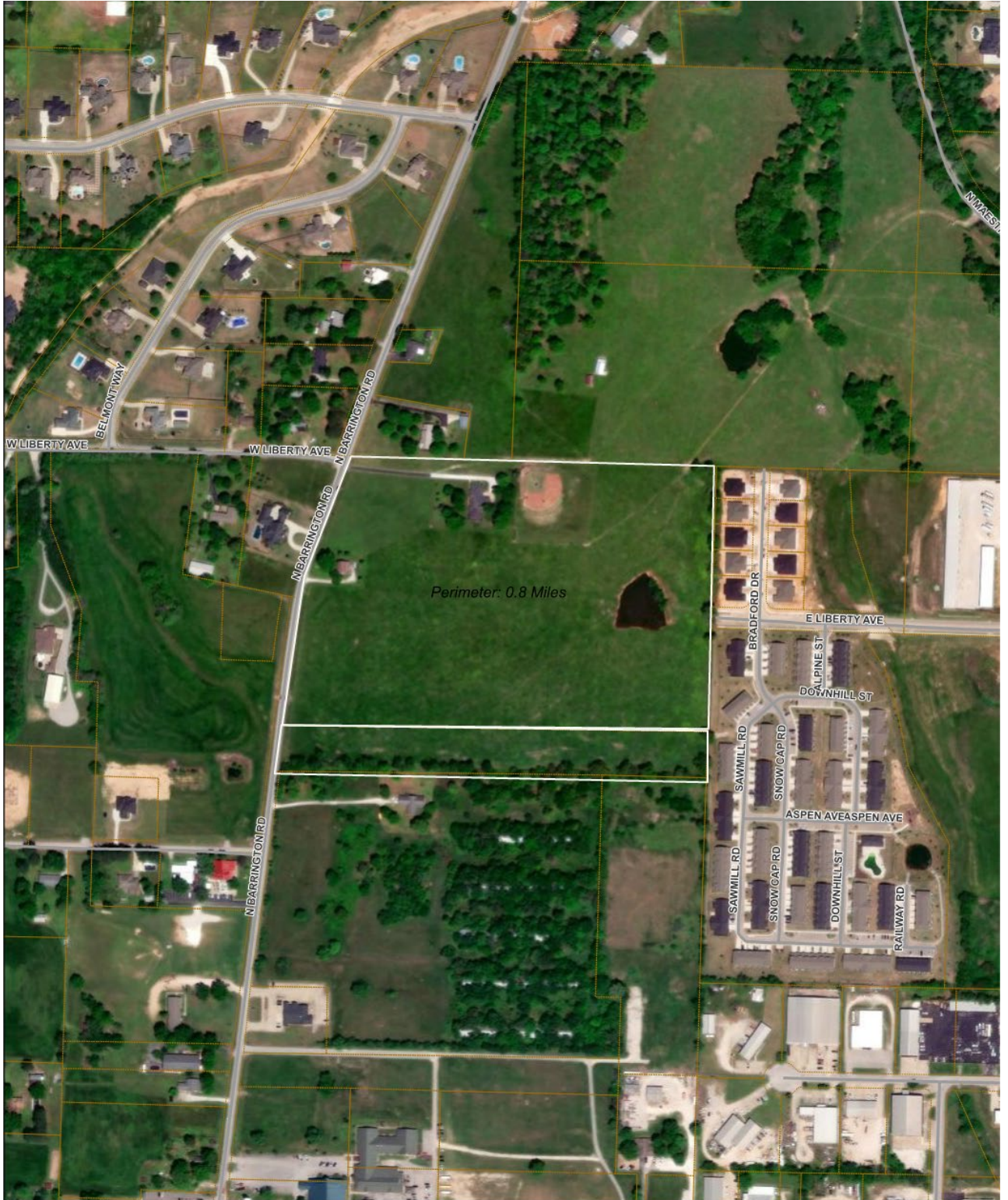
FIGURE 1: VICINITY MAP