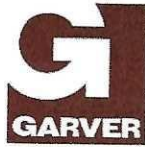
EXHIBIT A (SCOPE OF SERVICES)