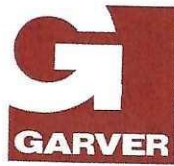
Exhibit B City of Tontitown Fletcher Avenue - Barrington to Klenc Garver Hourly Rate Schedule: July 2022 - June 2023