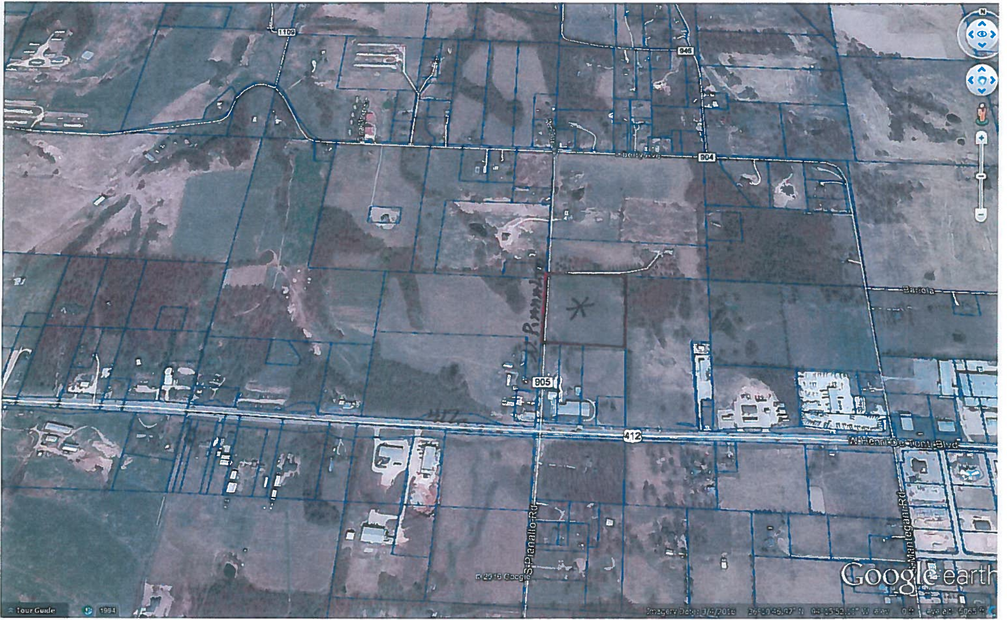
GCC - Rezone VICINITY MAP