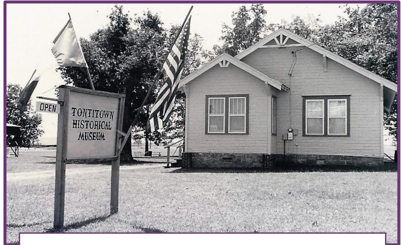
Tontitown Historical Museum during its first year. Opened 8-10-1986 ~ Dedicated 9-21-1986