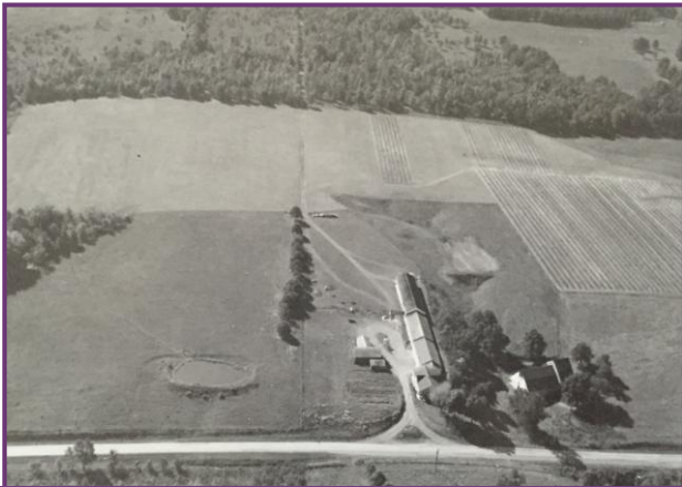
The Granata farm and winery