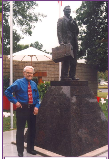
The Italian Immigrant statue at Tontitown City Hall,

The Tontitown City Council got behind the project in 1996 and commissioned Keith Black, award-winning artist from Prairie Grove, to sculpt the statue for Tontitown's special 100th anniversary in 1998.