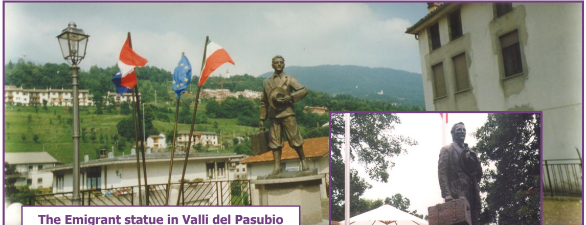
The Emigrant statue in Valli del Pasubio